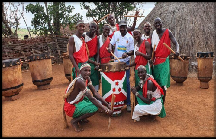
ATB Joins Burundi to Celebrate World Tourism Day 2022 Among the Rural Dwellers - September 2022