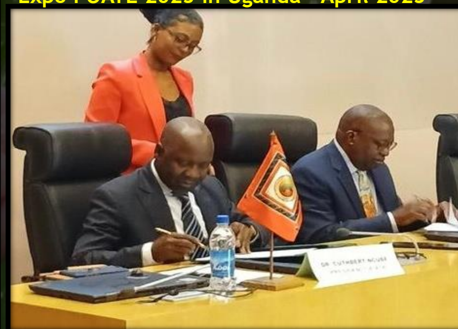
ATB Sign Historical MoU signing in Addis Ababa