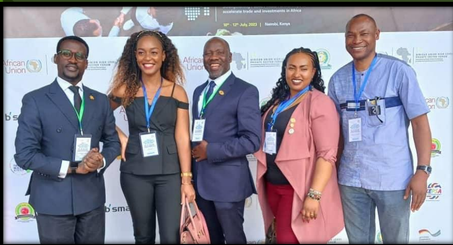
ATB Delegates at AU High Level Private Sector Forum 2023 session taking place at the Kenyatta International Convention Centre, Nairobi, Kenya.