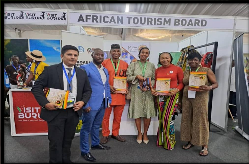
ATB Joins RWANDA TOURISM WEEK 2022