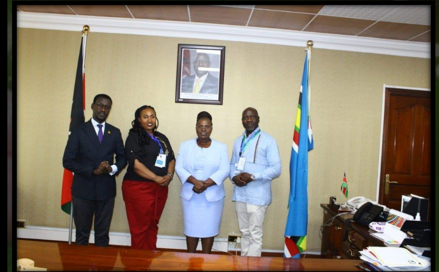
ATB teams up with Kenya's Ministry of Tourism to boost trade policies and showcase Kenya as a top-notch tourist destination.