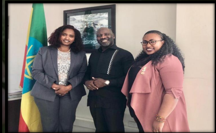
ATB Chairman Meets Ethiopia's Tourism Minister as the Country Embarks on New Tourism Infrastructures - October 2022