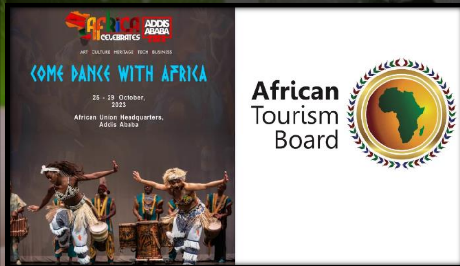
ATB renew partnership with Legendary Gold Ltd., organiser of Africa Celebrates - a pan-African Festival to be held between 25th-29th October, 2023