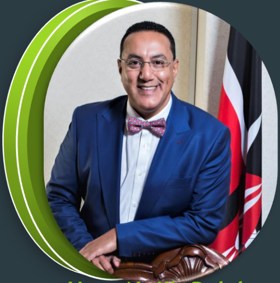
Hon. Najib Balala,

He born in 1967, is a Kenyan politician and international urban management expert. He was appointed as Cabinet Secretary for Tourism & Wildlife by President Uhuru Muigai Kenyatta in 2017. Balala has served as a Cabinet Secretary for various ministries, including Tourism, Mining, and Minister for Tourism. He is also the Chairman of the UNWTO Commission for Africa and was voted Best Tourism Minister in Africa in 2009. Balala works closely with private investors, conservation agencies, and regional development agencies to manage the economic potential of the tourism and wildlife sectors prudently and sustainably.