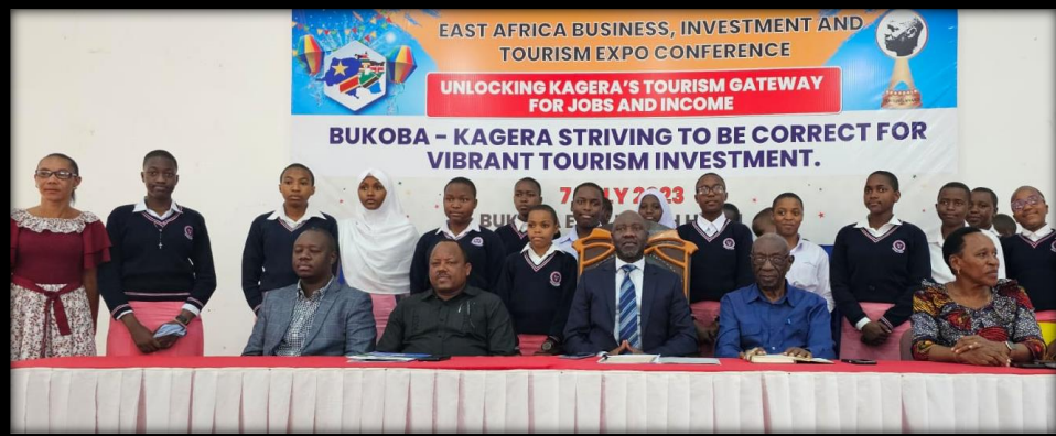
ATB at East Africa Business Investment and Tourism Expo Conference in Bukoba, Tanzania