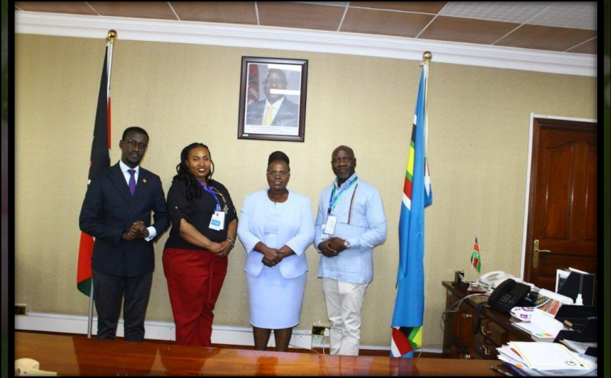
ATB teams up with Kenya's Ministry of Tourism to boost trade policies and showcase Kenya as a top-notch tourist destination.