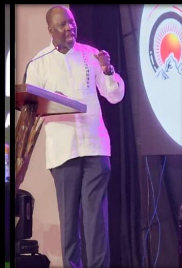
ATB partnered with Pearl of African Tourism Expo POATE 2023 in Uganda - April 2023