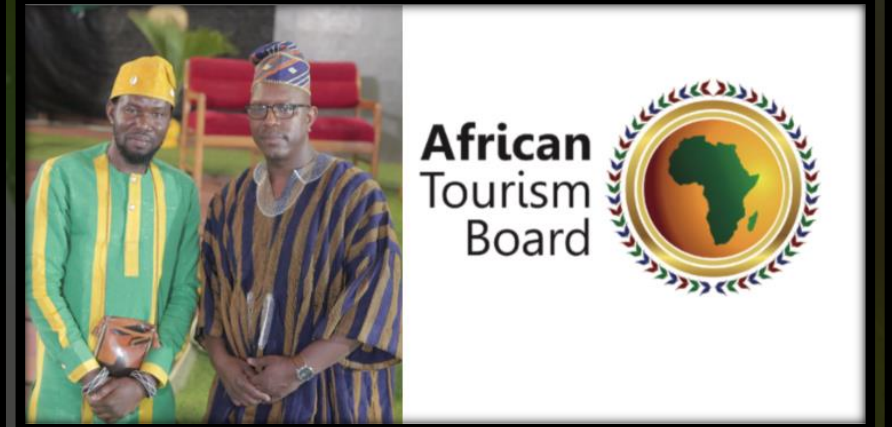
African Tourism Board collaborates with The Taste Of Afrika for 'Cultural Oneness Festival' in the North