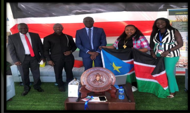
ATB team led by its Executive Chairman, Hon. Cuthbert Ncube, with the Minister of Wildlife Conservation and Tourism, Republic of South Sudan, Hon. Rizik Zakaria