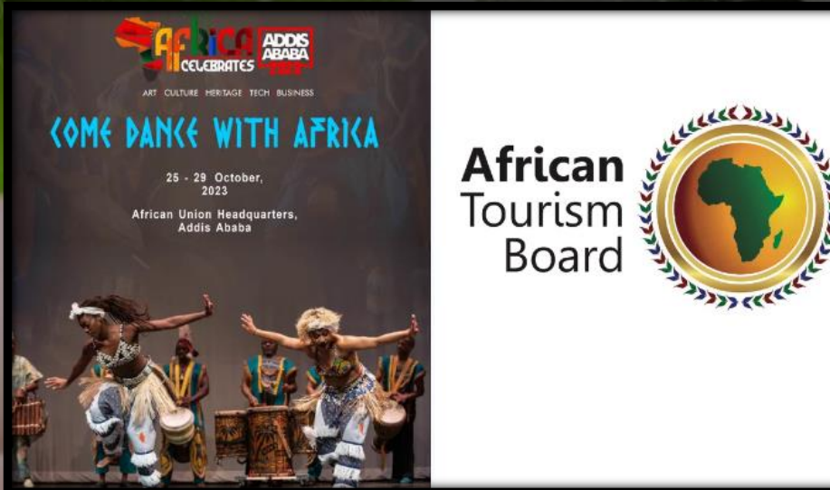
ATB President Calls for More Tourism Collaborations as AU, ATB Sign Historical MoU in Addis Ababa