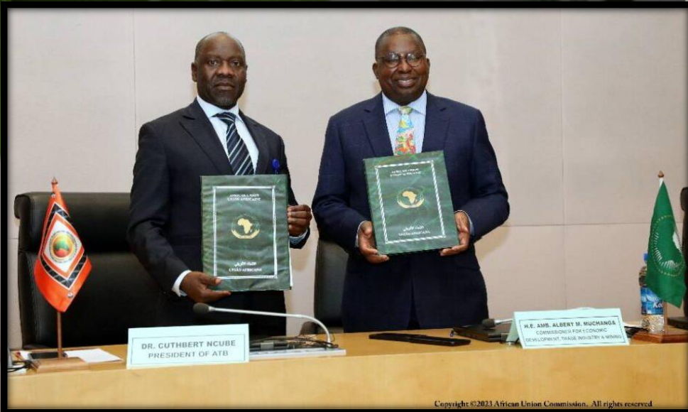
ATB President Calls for More Tourism Collaborations as AU, ATB Sign Historical MoU in Addis Ababa