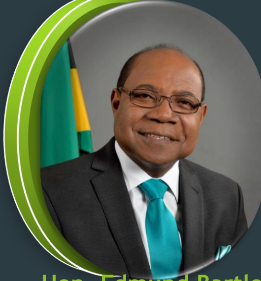
Hon. Edmund Bartlett

He born in 1967, is a Kenyan politician and international urban management expert. He was appointed as Cabinet Secretary for Tourism & Wildlife by President Uhuru Muigai Kenyatta in 2017. Balala has served as a Cabinet Secretary for various ministries, including Tourism, Mining, and Minister for Tourism. He is also the Chairman of the UNWTO Commission for Africa and was voted Best Tourism Minister in Africa in 2009. Balala works closely with private investors, conservation agencies, and regional development agencies to manage the economic potential of the tourism and wildlife sectors prudently and sustainably.