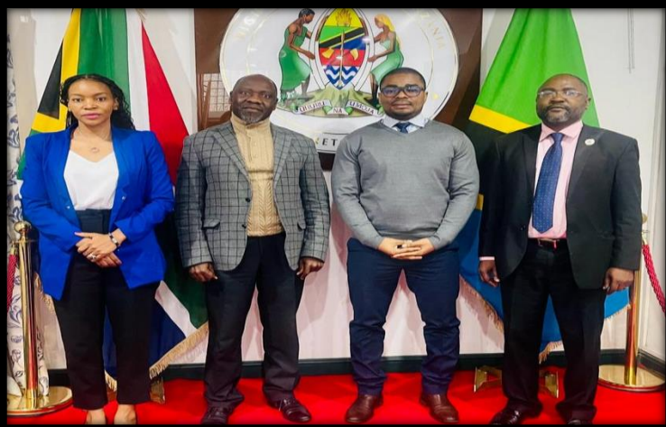
ATB Holds Bilateral Engagement with Tanzania Embassy in Pretoria